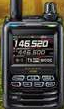
FT5DR Dual Band FM + C4FM Touchscreen Page 22