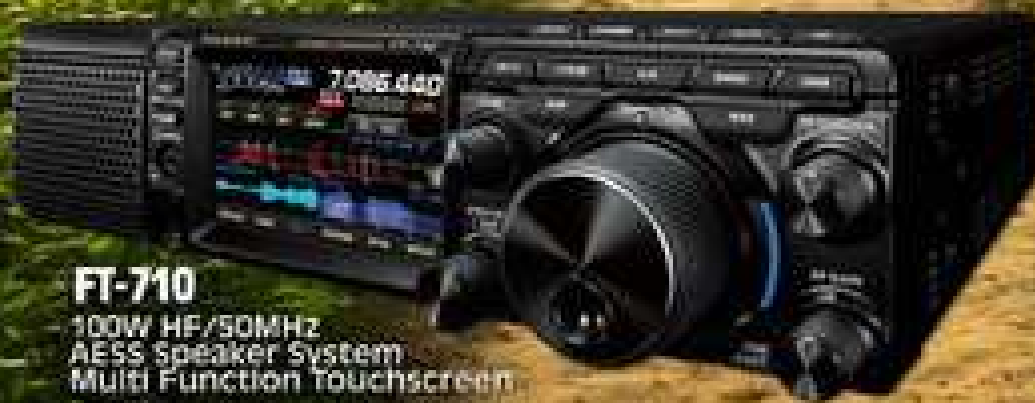
FT-710 100W HF/50MHz AES Speaker System Multi Function Touchscreen Page 16